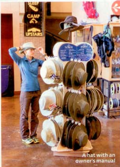
A hat with an owner's manual