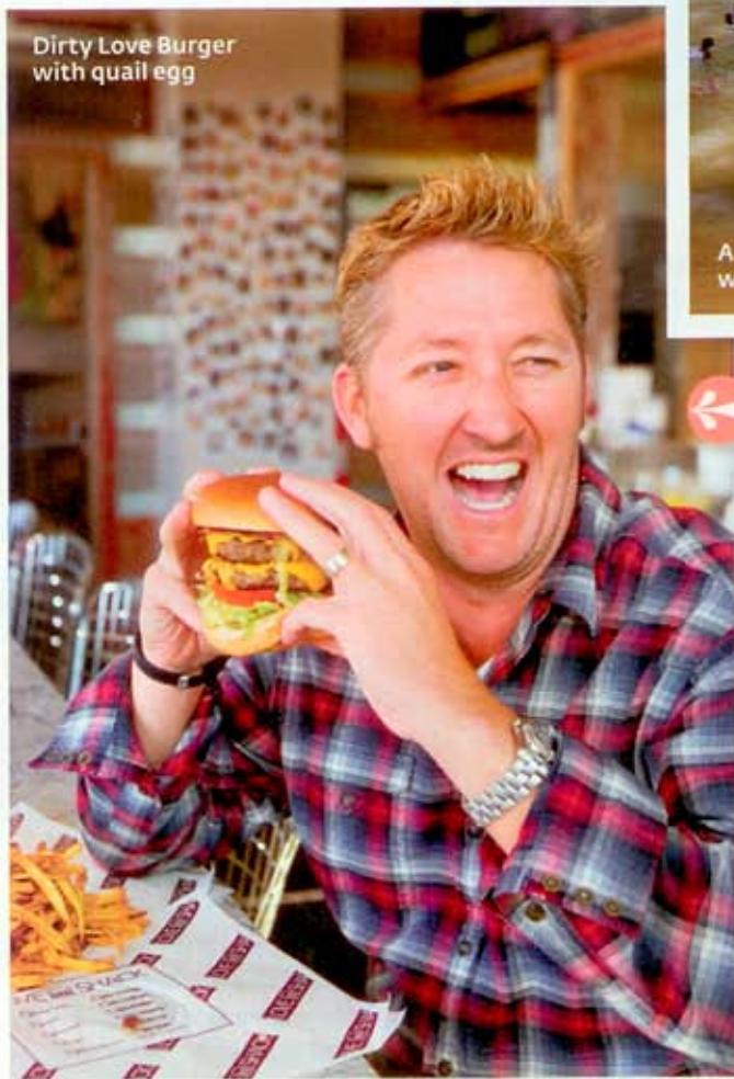
Dirty Love Burger with quail egg